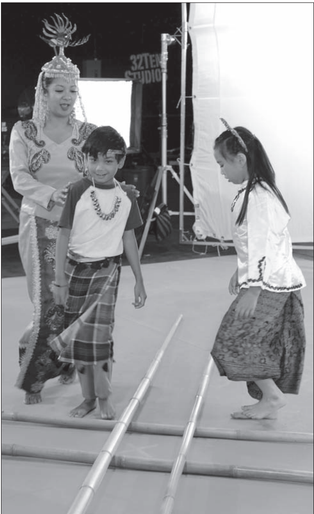
Likha dancers collaborate with Bindlestiff performers.