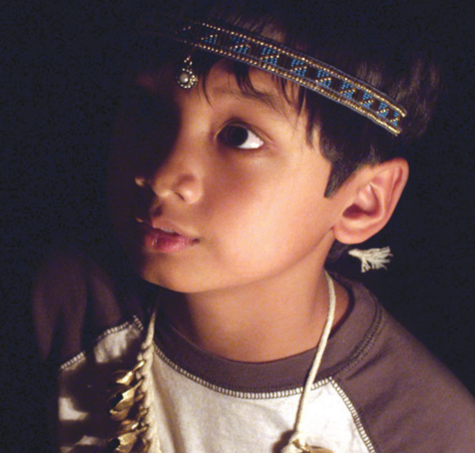
Prinsesa aims to open eyes and minds. (inset) All members of the cast and crew volunteered their efforts in a spirit of pride for Filipino culture, as well as solidarity with transgender and gender nonconforming children. Story on B5.